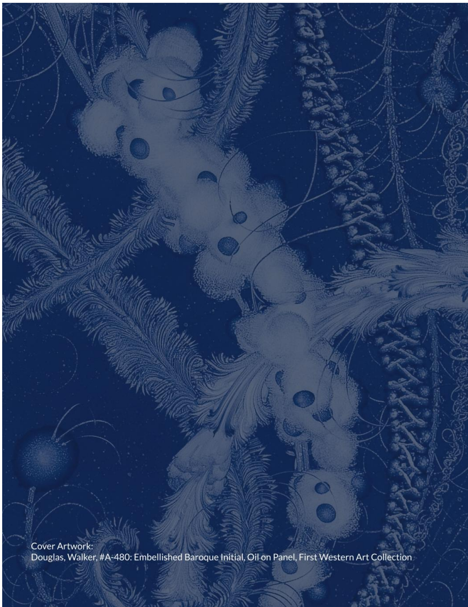
Cover Artwork: Douglas, Walker, #A-480: Embellished Baroque Initial, Oil on Panel, First Western Art Collection